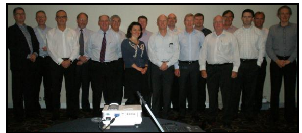
ASEA Coaches, Trainers & Assessors

Based on feedback from participating companies, the ASEA Program has been delivering value to the automotive sector through the projects undertaken by the participating companies. The successful transfer of knowledge in the ASEA Program depends on the skills, expertise and efforts of the coaches, so it is critical that ASEA only uses the best possible coaches.